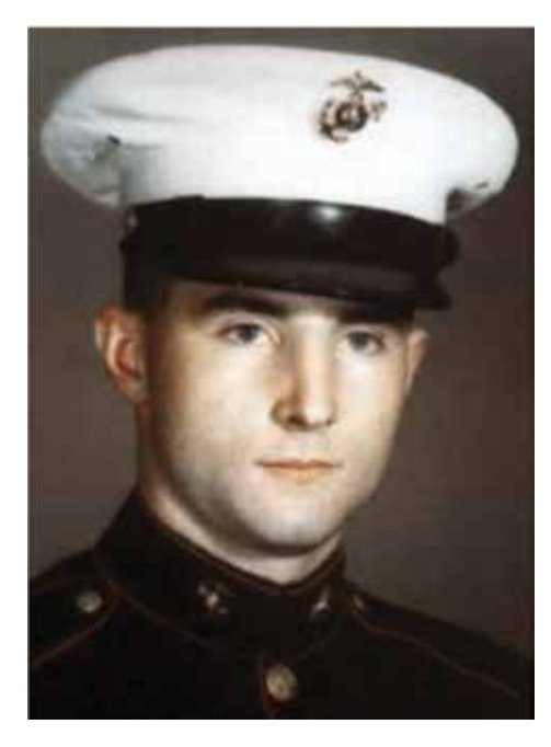
The Honorable Senator Charles Schumer U.S. Senate Washington, DC 20510