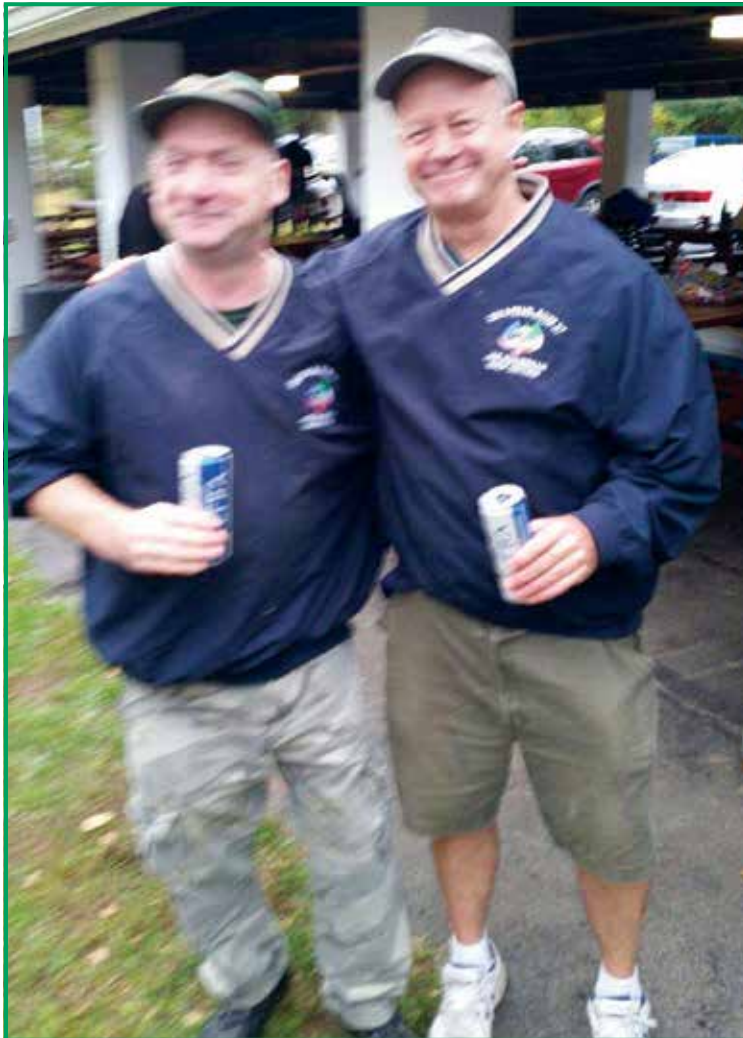
"Long Lost – Recently Found!"