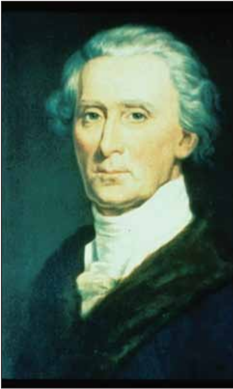
Charles Carroll of Carrollton

As the July 4th holiday approaches, sadly as with many of our other holidays, the true meaning of the day is lost amidst ballgames, cookouts, and fireworks. We forget that in that hot July of 1776 fifty six men came together to pledge their "lives, fortunes and sacred honor" to form a new country where "all men are created equal" and entitled to "life, liberty and the pursuit of happiness". We forget that, in an 18th century where aristocracy was the norm, what a radical statement this was and academics will be quick to point out that the execution of that vision was, and in some ways still is, imperfect. We forget these men were publically taking on the largest Empire in the world; prior history predicting they had little prospect of success and the risk of a hangman's rope if they failed. Even among those that do remember the meaning of the day, very few remember that nine of the men who signed the document that is arguably the greatest statement of freedom ever penned were Irish Americans.