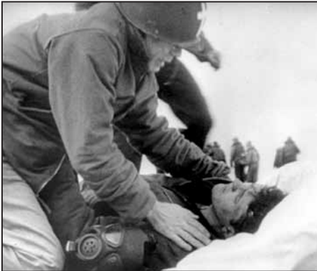
Chaplain Joseph O'Callahan ministers to an injured man aboard USS Franklin - 1945.

The Medal of Honor is the highest military honor bestowed by the United States. It is awarded for "conspicuous gallantry and intrepidity at the risk of his or her life above and beyond the call of duty while engaged in an action against an enemy of the United States." To achieve this honor in battle is exceptional enough, to earn this award when armed only with one's courage and faith is extraordinary. One such exceptional man was Fr. Joseph T. O'Callahan, S.J.