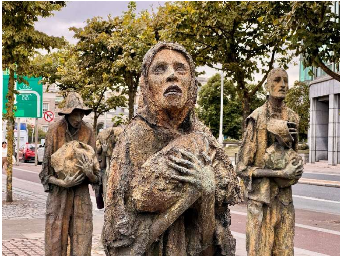
THE GREAT HUNGER MEMORIAL IN DUBLIN

The Great Hunger (1845–1852) is not just a story of suffering; it is a cautionary tale of man's cruelty, prejudice, and exploitation of his fellow man. Inexplicably, modern revisionists seem intent on whitewashing this horrific chapter of history, framing the suffering and the death of one million people to starvation and the forced emigration of another million as a tragic but unavoidable environmental disaster. A more recent defense runs along the lines of "Yes, Ireland lost a quarter of its population, but this was due to incompetence, not hatred," as if political