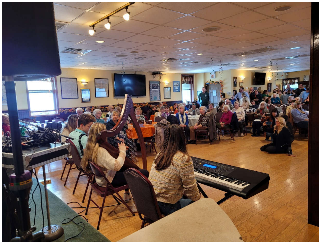
Just a portion of the seniors' audience looking on, captivated by the Irish musicians.